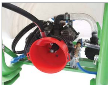
4-Diaphragm pump C-96, the best in its class, produced in our factory from casting to assembling.