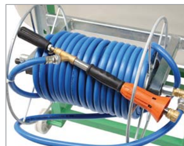
Hose and gun system.