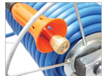
Long spray gun.