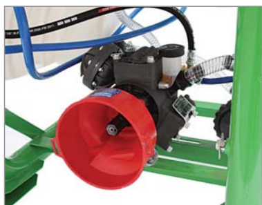
3-Diaphragm pump C-71, the best in its class, produced in our factory from casting to assembling.