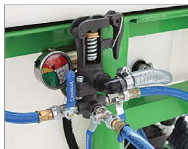
OG-403 Control unit, accurate adjustment of the spray.