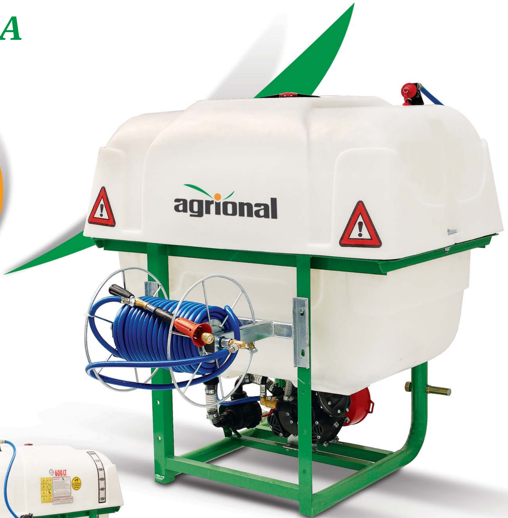
Viola SP 600

Mounted on 3-pt hitch of the tractor, powered by PTO via a shielded shaft. Required tractor power is 50 HP. Suitable for spraying orchards and gardens.